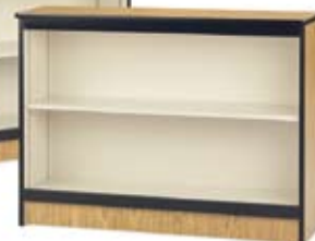
2BC36 One adjustable shelf. 48"W x 12"D x 36"H bookcase.