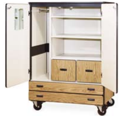
2513 Two adjustable steel shelves. Two 13¾"W x 19¾"D x 11½"H file drawers. Two 44"W x 24½"D x 3½"H paper drawers. One 12" coat rod. One 8"W x 11"H vanity mirror. Two hinged doors. Cabinet is 48"W x 28"D x 66"H.