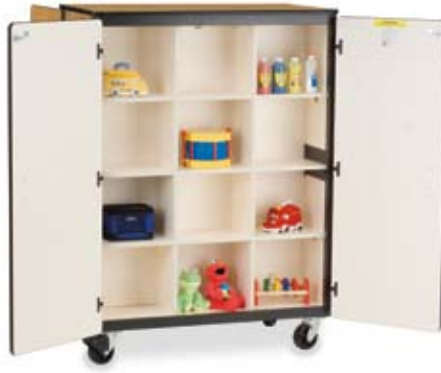
2509-24DF Double-faced cabinet with twelve 14½"W x 11½"D x 12¾"H cubicles and two hinged doors on each side. Cabinet is 48"W x 28"D x 66"H.

Virco offers a variety of 36", 66" & 72" high cabinets with thermofused melamine panel surfaces and a range of shelf configurations for storing textbooks, notebooks and related educational materials. Two models are available with either 15 or 30 tote trays; another double-faced mobile cabinet features 12 spacious cubicles per side. For teachers and students who need a place to keep oversized projects and art assignments, three Virco mobile cabinets include full-width paper drawer storage.