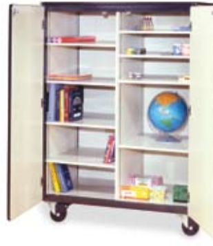
2502 Eight 24"W adjustable steel shelves. Two hinged doors. Cabinet is 48"W x 28"D x 66"H.