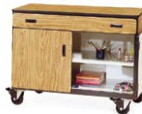
2321 One paper drawer and one adjustable shelf. Two hinged doors. Cabinet is 48"W x 28"D x 36"H.