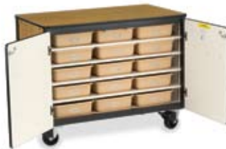
2301-15TT Five fixed steel shelves with 15 tote trays. Two hinged doors. Cabinet is 48"W x 28"D x 36"H.