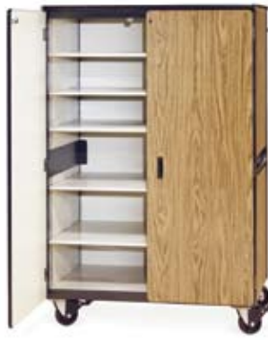
2601 Five adjustable steel shelves. Two hinged doors. Cabinet is 48"W x 28"D x 72"H.