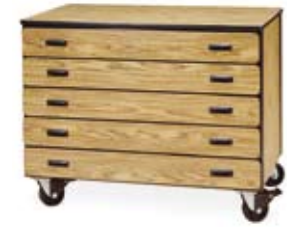
2325 Five 44"W x 24½"D x 3½"H paper drawers. No hinged doors. Cabinet is 48"W x 28"D x 36"H.