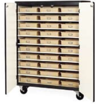
2501-30TT Ten fixed steel shelves with 30 tote trays. Two hinged doors. Cabinet is 48"W x 28"D x 66"H.