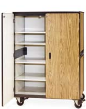
2501 Four adjustable steel shelves. Two hinged doors. Cabinet is 48"W x 28"D x 66"H.