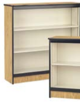
2BC48 Two adjustable shelves. 48"W x 12"D x 48"H bookcase.

Like our mobile cabinets, Virco bookcases are engineered for the long haul. Sturdy steel frames give our bookcases superior strength and durability. Unlike ordinary particleboard shelves that can easily bend or warp under heavy loads, our reinforced 20 gauge steel shelves are designed for years of use. Virco bookcases are also 48" wide, 33% wider than standard bookcases, giving you more storage space for your dollar. And because our bookcases come factory assembled, you won't have to fuss with messy glue, missing screws or confusing assembly instructions.