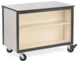
2301DFND Double-faced cabinet with one adjustable steel shelf on each side. Cabinet is 48"W x 28"D x 36"H.